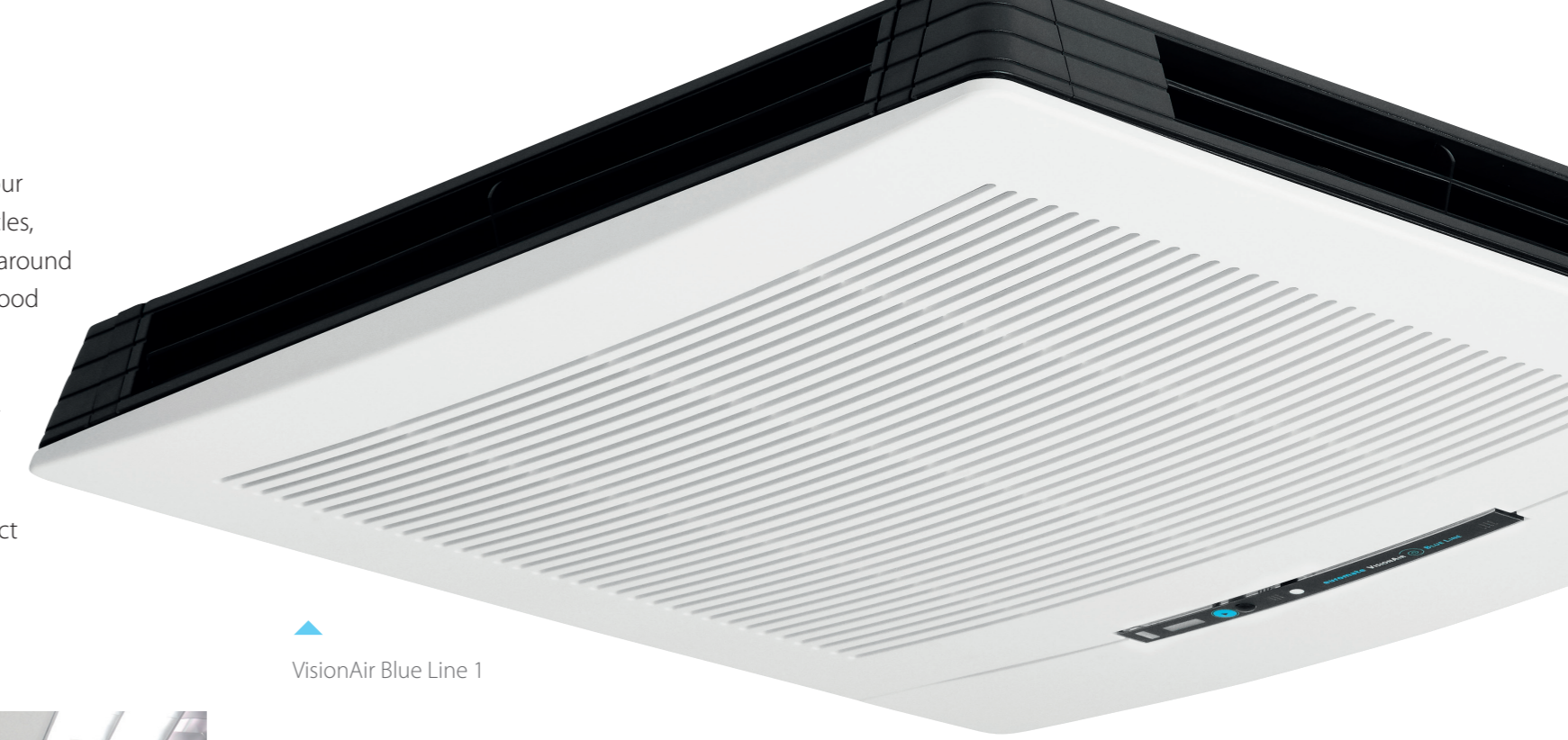
VisionAir Blue Line 1

The VisionAir Blue Line allows you to effectively tackle any problem with your indoor air. Depending on the room and the specific pollutants, the VisionAir Blue Line offers a perfect made-to-measure plug & play solution.