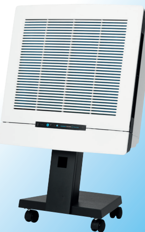
VisionAir Blue Line 1 on display

* Ideal for countries where service contracts for maintenance cannot be concluded.