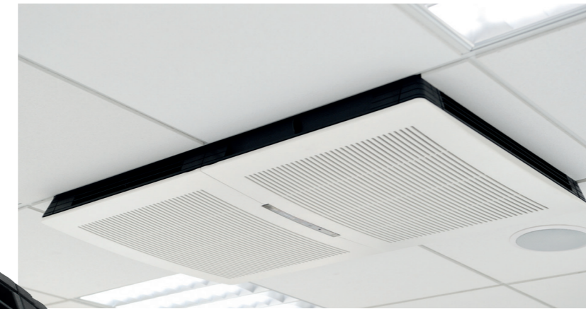
VisionAir Blue Line 2